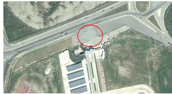
Figure 2. View of Final Point

As mentioned in the previous paragraph, the main point is to decide the right transportation vehicle for the students. The reason is that if the University buses are full, they may be late to their classes. This may result with backfire. Besides, the distance between the two points is almost 10 kilometres. As for the final station, it is showed in fig. 2.