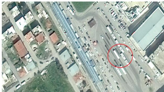
Figure 1. View of the Initial Point

In regard to the first initial point, there is a train station and the students are commonly using this vehicle in order to reach initial point. There are three ways to be able to reach the University. First preferences are University buses. The second number is 750 buses which belong to the municipality. The last number is 850 which is under the control of the municipality. Students must decide on one of the three options in order to reach University but in this project, the main aim is to optimize the number of University buses since municipality buses are not only preferred by students. The initial point is shown in Fig. 1.