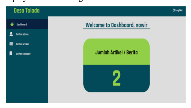
Figure 2. Main Page Display

The results of this study are a website-based information system, in order to facilitate the Tolada village community in accessing information quickly and accurately. This information system has several important parts contained in the application such as the login page for admin, then the main page, user list, category list and announcements. The system display is shown in Figures 2 and 3.