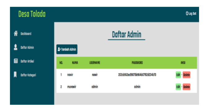
Figure 3. Admin List

The admin dashboard is a control panel that functions to manage all website activities. When the admin manages to enter the username and password correctly, it will go to the admin dashboard page. If the username and password are successful then the admin can login, if the password or username is wrong then the admin will fail to login. The admin dashboard feature on the tolada village information system has several more sections such as adding admin, adding articles, listing categories/announcements.