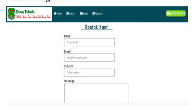
Figure 4. Village contact information display

or delete categories on the tolada village information system, while the list of articles is used by the admin to add articles or village information for the community. In addition to being able to access information, the Tolada village community can also contact the admin by telephone, email, or directly to the website by clicking the village contact button as shown in Figure 4.